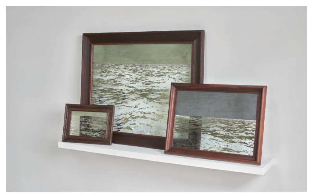
Yoan Capote, Retrato de familia (Family portrait), Vintage engraved mirrors, Variable dimensions, 2023

However, the journey is indeed more than that. It is a particular capacity of human beings to extend the borders of their minds and bodies. This is especially notorious when these human beings are artists. They can travel into themselves and exit, go back and forth from their specific geographies with the help of their imagination or spirit; and even if the trip never takes place, they are able to transmit to us that sense of freedom that is present in any attempted journey.