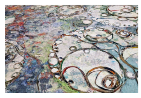
Fernando Rodríguez Falcón, Untitled (detail), Paper pulp from Atlas de Cuba, triptych; 145 x 117 x 2 cm each, 2023